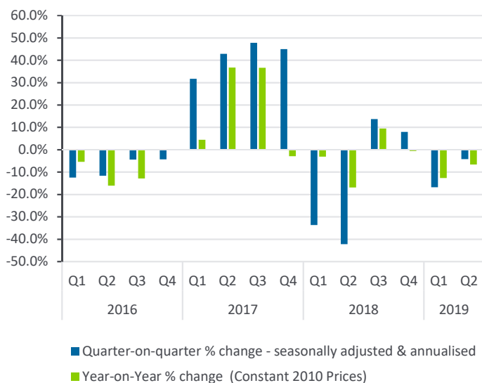
Figure 1: Year on year change in real (2010) agricultural GDP per quarter

StatsSA reports that South Africa's GDP grew by 3.1% in the second quarter of 2019 and that Agriculture, Forestry and Fisheries contributed -0.1% to the national number having reportedly contracted by -4.2% since the first quarter of 2019. The StatsSA report includes all sectors and is focused on a seasonally adjusted, annualised movement from Quarter 1 to Quarter 2 (Figure 1 - blue). This is comparable to the rest of the economy, but complicated for agriculture given timing of delivery by various subsectors. Relative comparison Quarter 2 2019 numbers to Quarter 2 2018 performance removes the need for seasonal adjustments and provides a simpler picture of agricultural performance in the past quarter. By this metric, agriculture declined by 6.7% (Figure 1 - green).